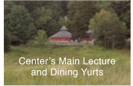
Center's Main Lecture and Dining Yurts