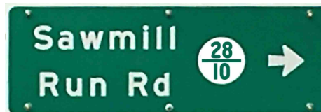
county road sign