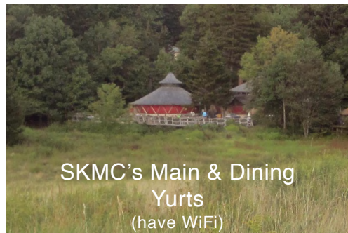
SKMC's Main & Dining Yurts (have WiFi)

At Spruce Knob Mountain Center, SKMC, in West Virginia